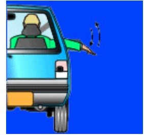
I intend to slow down or stop