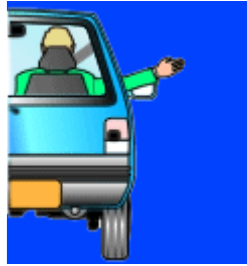
I intend to move out to the right or turn right