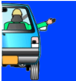
Beckoning to traffic from behind to overtake